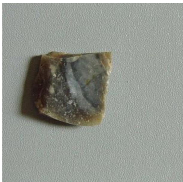
Figure 4: Probable gunflint recovered from the battlefield on Stow on the Wold (1646)

3.3.18. It is highly unlikely that human remains will be discovered as part of a metal detecting survey, but if they are, work in that area of the survey must cease, the police be informed, and advice sought from the Trust's Research Coordinator and Archaeological Advisor.