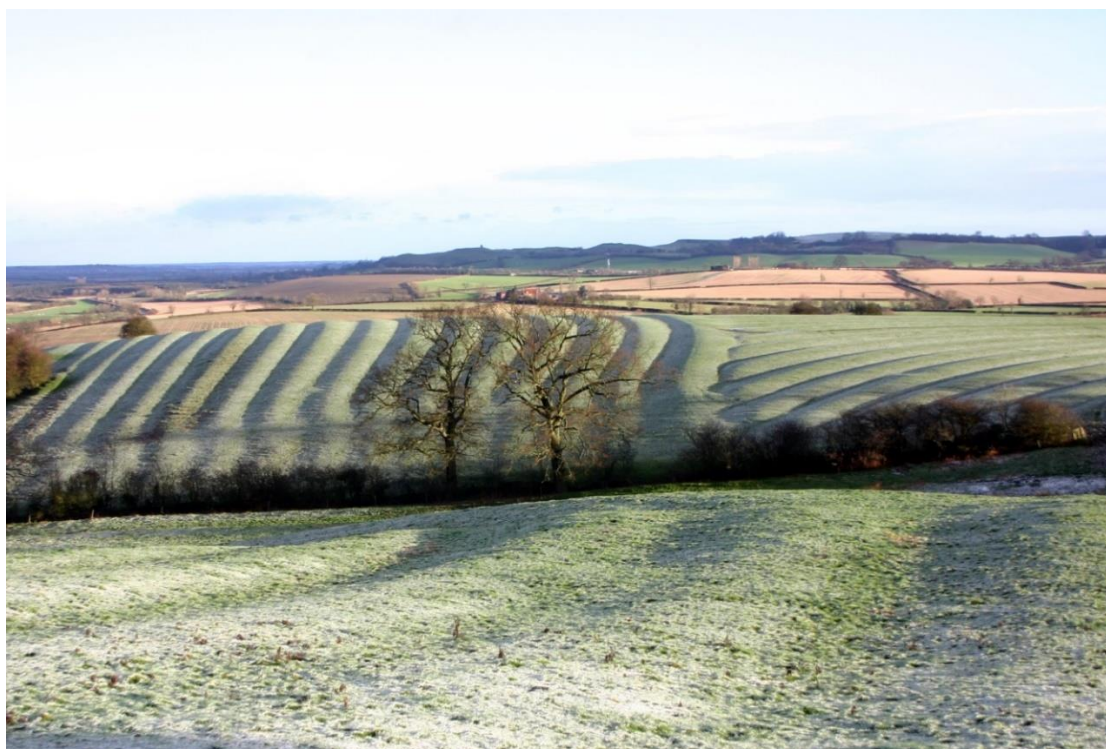
Figure 1: Ridge and furrow at Edgehill.

2.15. Early enclosures were found around settlements, but they might also be found in consolidated demesne or in enclosures for pasture, particularly sheepwalks. The process of enclosure whereby lands farmed communally were divided up into parcels to be held in severalty by individual owners took several centuries to complete and varied in trajectory across the country. But it is important to note that while open land, of any type, could be divided and enclosed, the reverse rarely if ever happened, i.e. enclosed land was almost never thrown open and made commonable again. Thus, by identifying and mapping the remnants of all unenclosed land from what survives today and from historic map and other documentary sources it is possible to establish the very minimum of what would have been unenclosed land in the earlier centuries.