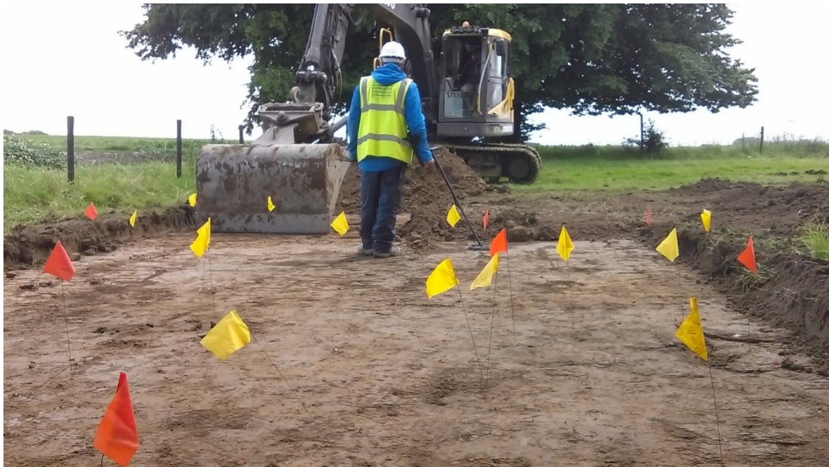
Figure 5: Waterloo Uncovered stripping back the top soil at Hougoumont. The majority of flags mark musket balls

3.4.7. Deep ploughing of pasture or on land where there is a possibility that secondary stratification has occurred, can bring objects closer to the surface and therefore locatable with a metal detector. The arrow heads found at Towton (1461) may have been located due to this process. This can, however, have a negative impact on the archaeology as deep ploughing can damage the objects and lifting them from a stratified and more corrosion stable position in the ground can increase rates of decay.