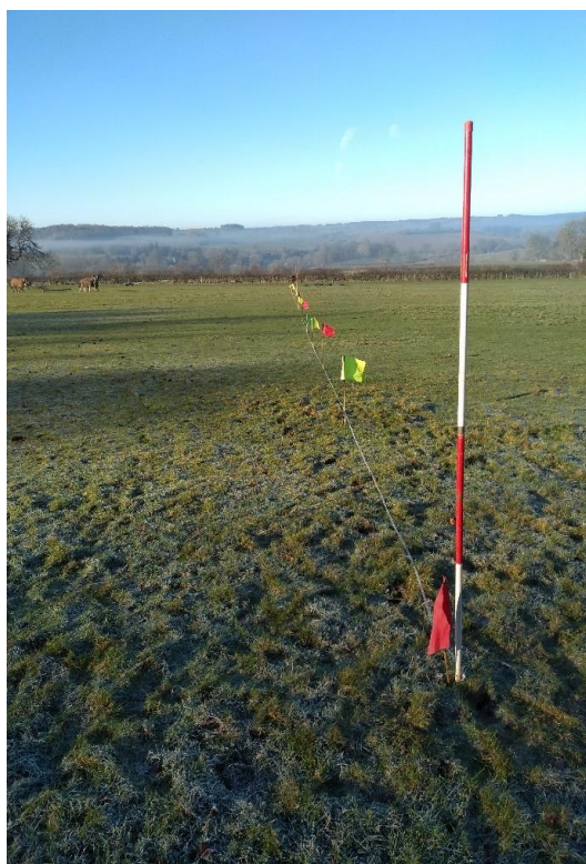
Figure 3: 5m transects baseline laid out at Stow (1646) battlefield

3.3.16. The spacing of transects should be determined by the research objectives of the project. If a large area needs to be covered then a reconnaissance survey with 10m transects may be used. This should, at least for the early modern period, be sufficient to identify areas where some battle activity took place and help to target future re-survey work using 5m or 2.5m transects. Until the completion of the Battlefields Trust Mortimer's Cross survey in 2022, the search for medieval battlefields was judged to be best undertaken using 2.5m transects as this increased the chances of locating relevant finds because experience at Bosworth suggested that, for such early battlefields, these were very limited. However, the Mortimer's Cross survey 14 demonstrated that surveying at 2.5m transects was still no guarantee of success and that, if large areas of ground need to be reconnoitred, an initial 10m transect approach might still be best, particularly if time and resources are limited. This though requires more research.