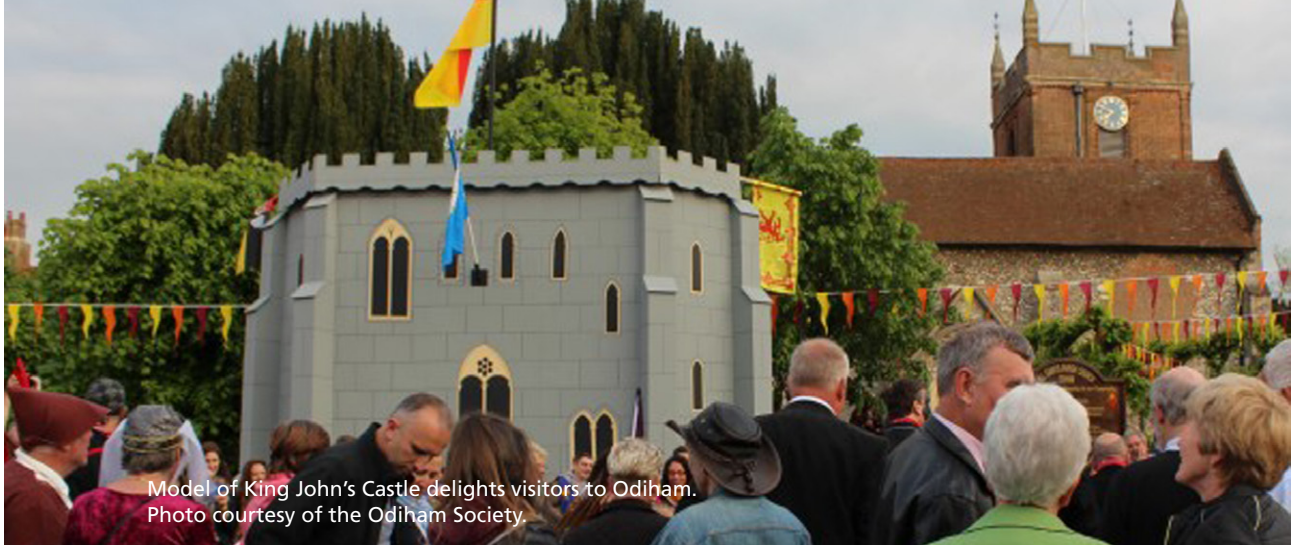
Model of King John's Castle delights visitors to Odiham.

materials. Those materials are specifically designed to support the school curriculum and have often been given/supplied to the schools free of charge. Therefore they may feel that they are already covering the subject in the best way for their pupils.