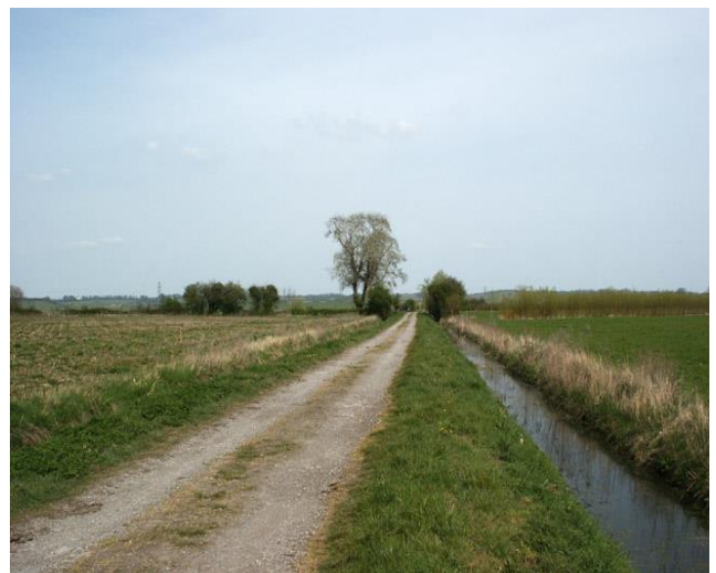
Langmoor Drove, Sedgemoor

In October we were very concerned to learn that Sedgemoor District council had received a planning application to erect a 150ft wind turbine in a field immediately adjacent to the boundary of the registered battlefield of Sedgemoor. Such a development would have had a severely adverse impact on the character of this extremely evocative battlefield. We were able to alert English Heritage (who had not been consulted, as they should have been) to the application, marshal opposition through social media and the Trust website and secure an article in the Daily Telegraph. In the face of a storm of opposition the application has been withdrawn. Thanks are due to all those who took the trouble to let the Council know their views about what was a highly inappropriate proposal. We will continue to monitor the situation at Sedgemoor in case similar applications are made in the future.