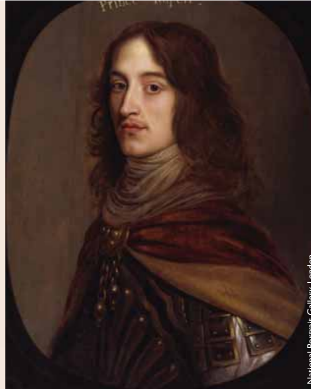
Prince Rupert (1619-82) was Charles I's nephew. A gifted child, skilled in languages and mathematics, he was involved in military actions from the age of 14.