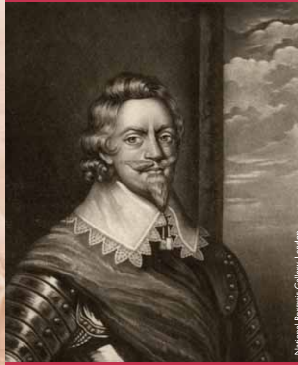
General Sir Patrick Ruthven, Earl of Forth commanded the royalist troops with Prince Rupert